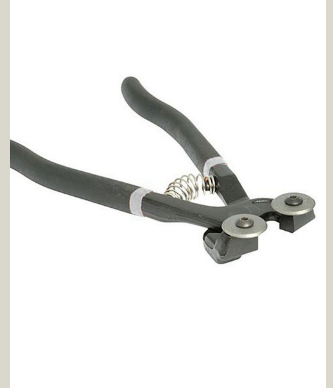
Nipper: Mosaic Cutter